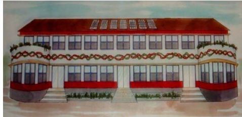
Proposed Ramnagar Eco Community Centre & Primary School